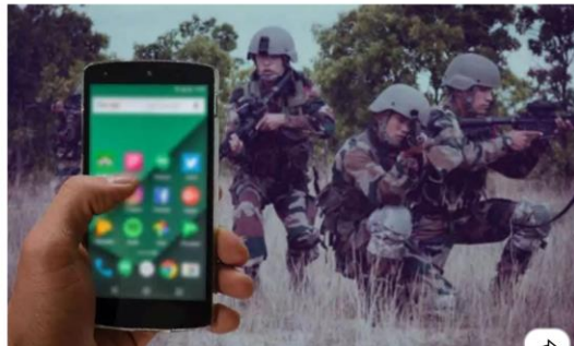
Social media platforms: Only eight Army personnel violated ban

New Delhi: The ban imposed by the Indian Army on the usage of 89 smartphone applications, including social media platforms like Facebook and Instagram, since June last